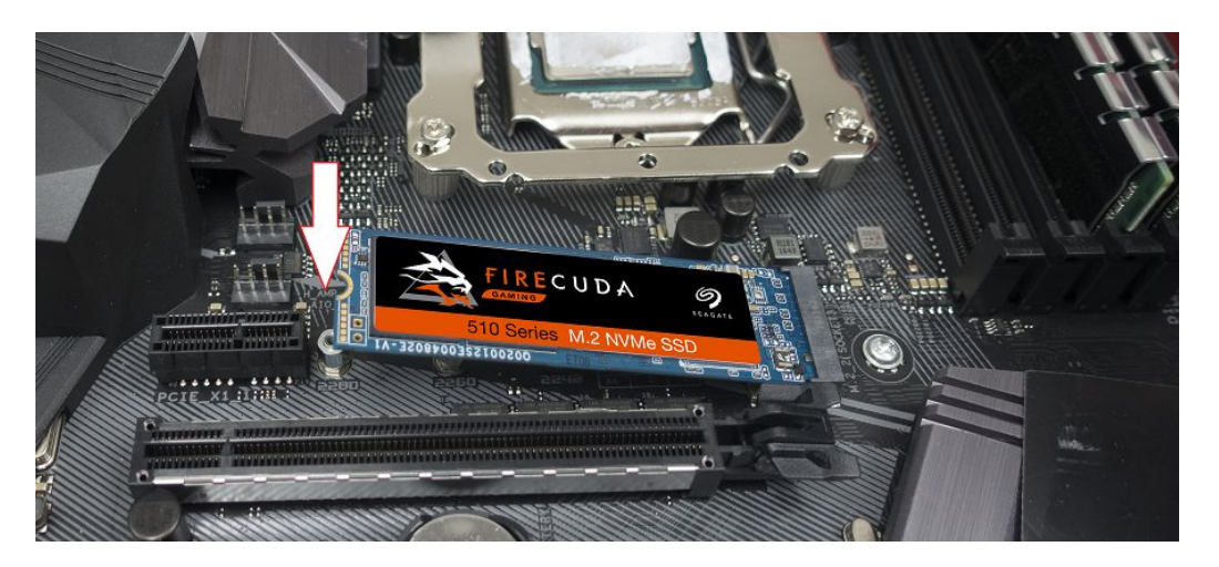
Figure 3: Seagate M.2 SSD in the M.2 Slot

8. Insert the FireCuda 510 SSD with the pinside going into the M.2 slot and the label side facing the top at a 30 degree angle.